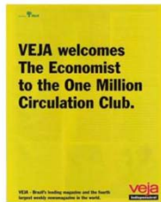
Picture Caption: Largest weekly news magazines (US News is now monthly). The ad run by Veja in the Economist to welcome them to the over 1 million club.